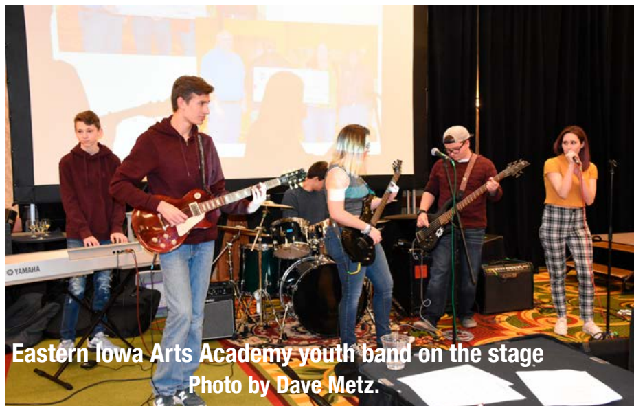
Eastern Iowa Arts Academy youth band on the stage