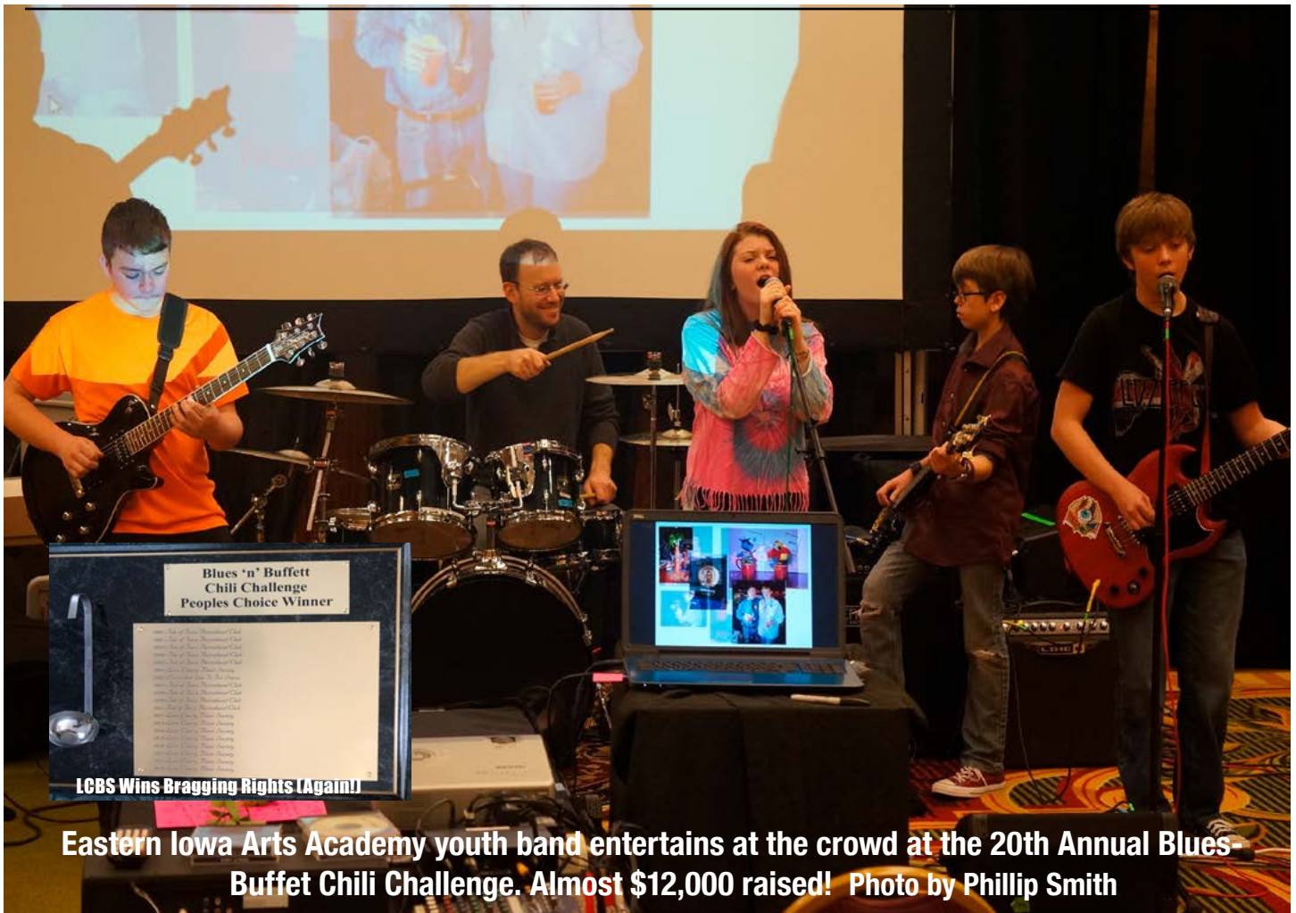
Eastern Iowa Arts Academy youth band entertains at the crowd at the 20th Annual Blues- Buffet Chili Challenge. Almost $12,000 raised!