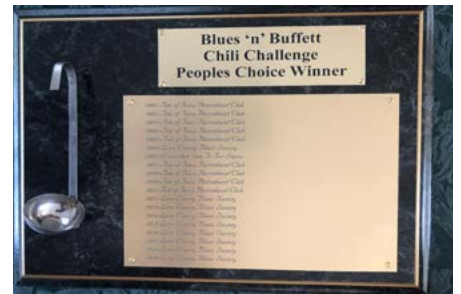
LCBS Wins Bragging Rights (Again!)