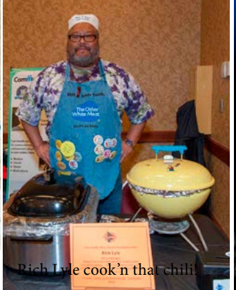
20th Annual Chili Challenge SUNDAY FEBRUARY 9, 2020

The LCBS and the Isle of Iowa Parrothead Club doing it again. Catch some of the fun by cooking, attending, or helping at the 20th Annual Blues 'N'Buffett Chili Challenge. See more at http://bluesbuffet.com