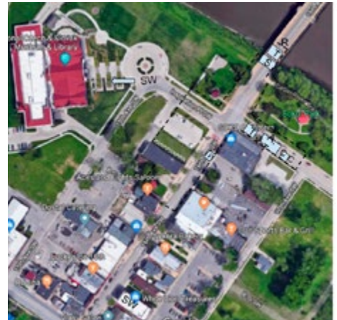
Concept Map of the Venue

Czech Village Blues will also feature a youth stage at this year's festival where young, local Blues performers will have the opportunity to "show their stuff" in front of a large audience beginning at 4:30pm.