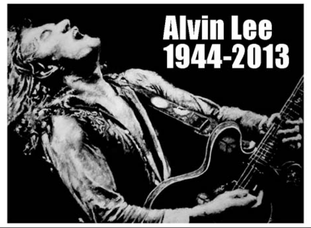
Alvin Lee 1944-2013