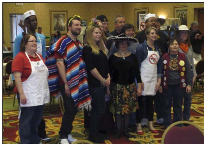
The LCBS Team

"There was Frankie Lyman, Bobby Fuller, Mitch Ryder..."