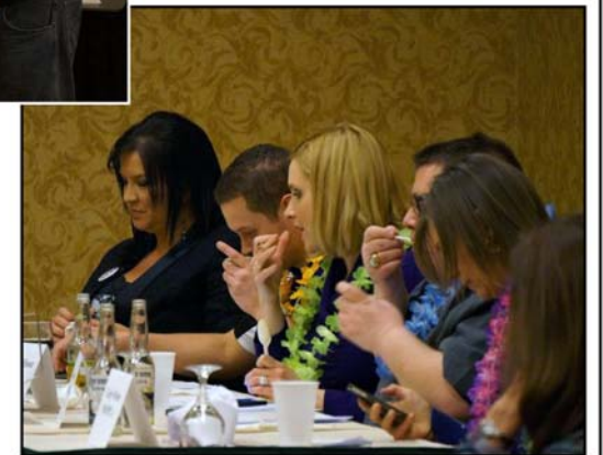
Center; Members of the Iowa of Isle Parrotheads receive their portion of the donations for the Community Free Health Clinic. Below; judges "struggle" with the arduous task of deciding whose chili is the best.