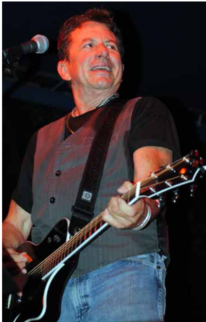
Joe Ely at the Iowa Arts Festival in Iowa City

I got to experience firsthand on Friday June 3rd, a tumbleweed on fire from Texas that blew into the heart of downtown Iowa City....Joe Ely!