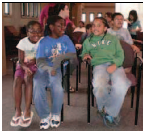
The kids in attendance were really enthusiastic (high energy) with the music and cool instruments.

The large group of K-4 grade students that were in attendance were somewhat of a tough crowd, though. They seemed to be really attuned to today's music.